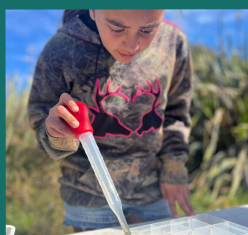
Engaging & Hands On