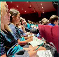
Grip Leadership Conference

Beyond their day-to-day roles, our Student Council take part in a range of development opportunities such as the GRIP Leadership Conference, the National Young Leaders Day, a school Leadership Learning Day, and an end-of-year Leadership Lunch Celebration. These experiences build confidence, grow leadership skills, and connect our students with wider networks of young leaders.