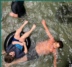
Senior Camp Redwood Valley

At Rangiora School, we know that real growth happens when students are challenged to do hard things. Our Year 7 & 8 learners are offered a wide range of EOTC opportunities, alongside two camps, that encourage them to step outside their comfort zones, take on new challenges, and discover what they are capable of. Through challenge by choice, students build resilience, confidence, and determination. These experiences strengthen teamwork, problem-solving, and independence. By providing so many opportunities to take on challenges, our senior students develop the courage and confidence to face obstacles head-on, knowing they have the resilience and skills to thrive both at school and in the years ahead.