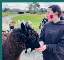
Integrated, Connected & Authentic

Our school curriculum is deeply grounded in our values and reflects the unique identity, history, and environment of our local community. Designed in partnership with the community and guided by our school pepeha, our themes and units are carefully chosen to connect with seasonal changes, significant local events, and the natural taonga of our area.