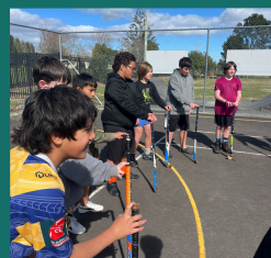
Interschool Sports Events & Tournaments

At Rangioru, we offer our Year 7 & 8 students a wide variety of sporting opportunities through Western Bay and Interschool events. From cross country, athletics, swimming, rippa, and netball to other activities that spark their interest or fuel their passion. All of our Year 7 & 8 students take part in the AIMS Games, one of New Zealand's largest sporting events for intermediate-aged students.