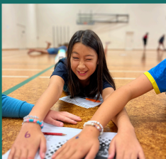
Leadership Learning Day & Leader Lunch

Together these leaders are at the heart of our school culture - inspiring their peers, creating opportunities for others, and ensuring our values are woven into everyday life at Rangioru.