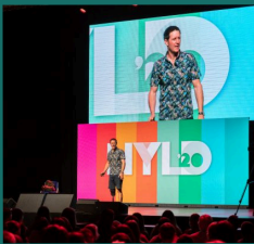
National Young Leaders Day

Our current additional leadership pathways are: Sports Leaders, Arts Leaders, and Kaitiaki Tikanga.