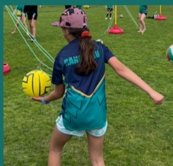
Western BOP Sports Events & Tournaments