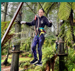
Adrenalin Forest High Ropes