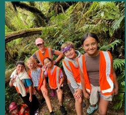
Hiking / Bush Walking