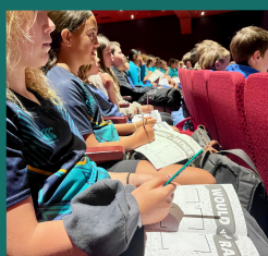
Strong Literacy & Numeracy