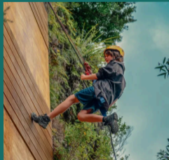
Senior Camp Ngatuhua Lodge